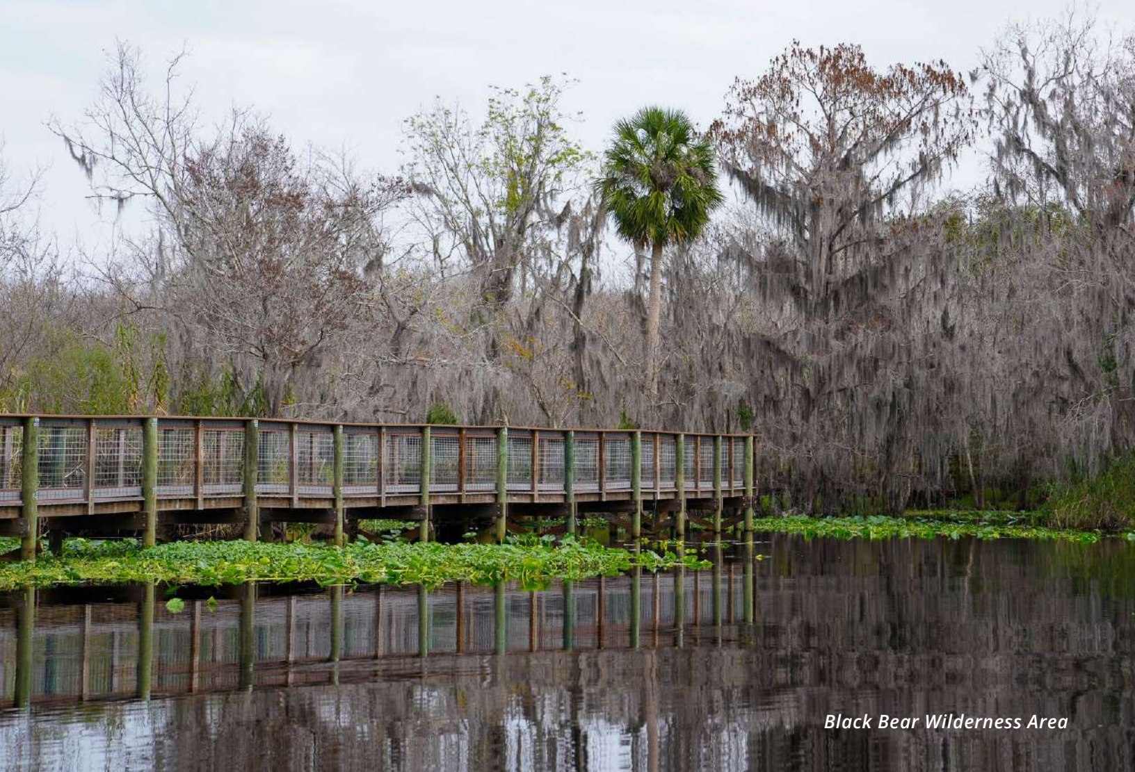
Black Bear Wilderness Area

SEMINOLE COUNTY PARKS AND RECREATION DEPARTMENT EXTENSION SERVICES | PARKS AND TRAILS | LIBRARIES | RECREATION