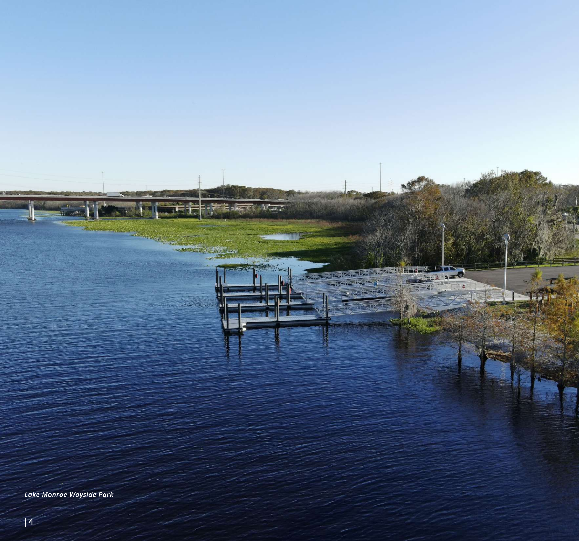
Lake Monroe Wayside Park