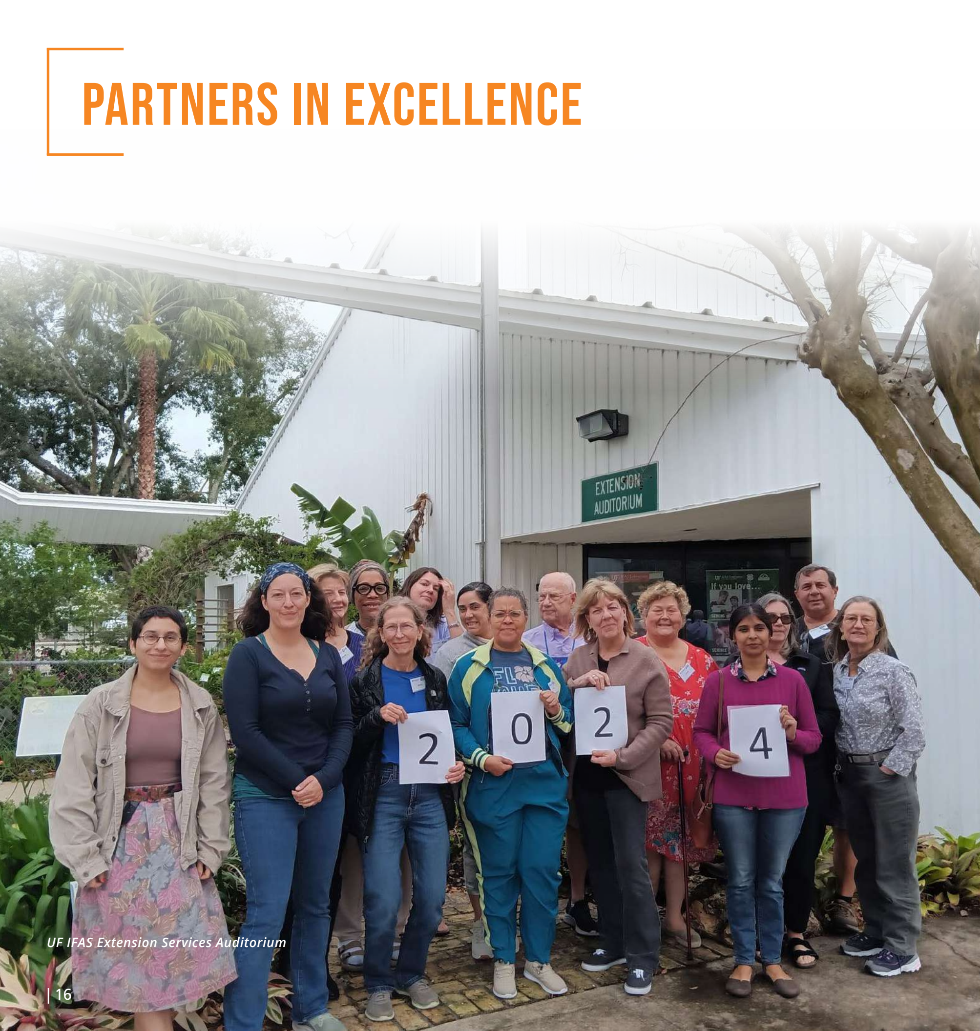
UF IFAS Extension Services Auditorium