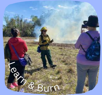
Learn & Burn