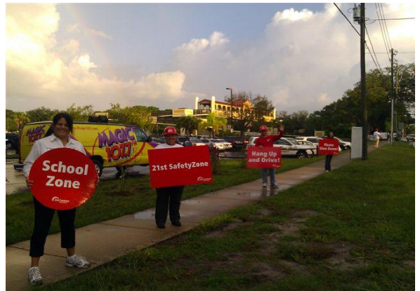
Lake Mary Safety Zone