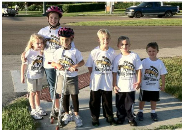
Partin Elementary Walking School Bus