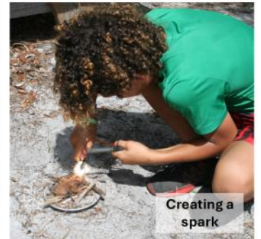
Creating a spark