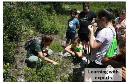
Learning with experts

A BIG thank you to all of our amazing guest speakers and volunteers who donated their time for our campers this summer!