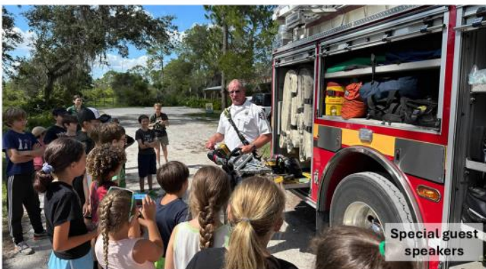
Special guest speakers