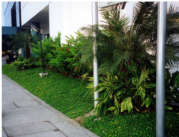
Figure 9. Perennial peanut along a street and commercial building.

Other methods of weed control do not appear to reduce establishment time. For grassy weeds such as crabgrass, bermudagrass, and bahiagrass, the herbicides Fusilade®, Poast®, Select®, and Prism® are cleared for use during establishment. Basagran® is effective for control of yellow nutsedge as well as a few other select broadleaved weeds. It is approved for use on perennial peanut during establishment.