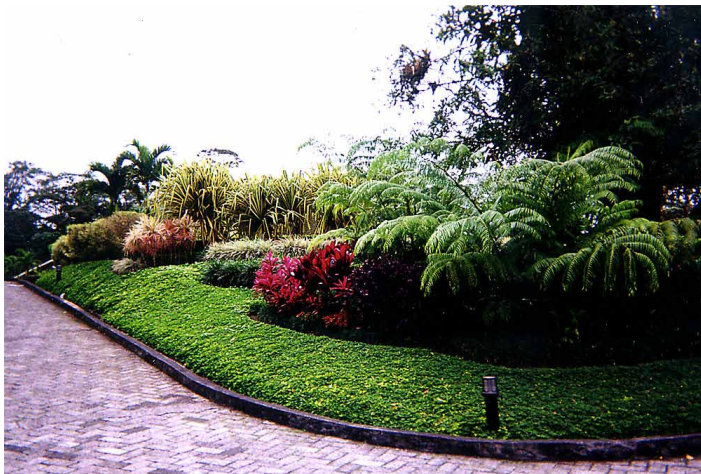
Figure 5. Perennial peanut in a formal landscape.