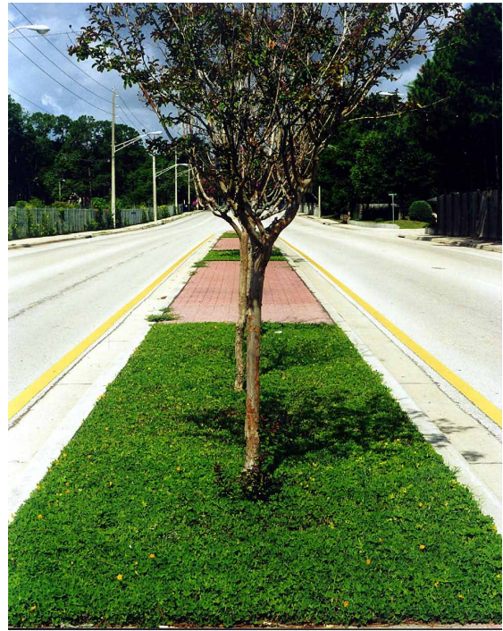
Figure 3. Perennial peanut groundcover in a road median.

Rhizome perennial peanut has several potential advantages in the managed landscape. As its name implies, perennial peanut is long-lived and doesn’t require replanting once established.