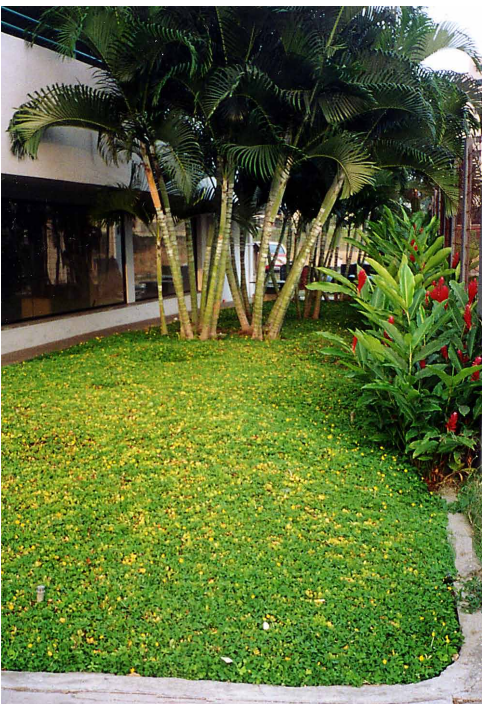
Figure 8. Perennial peanut used in a mall area with partial sun and shade.

Like all legumes, perennial peanut obtains its nitrogen from Rhizobium species bacteria associated with the plant's root system. Because perennial peanut is propagated by rhizomes that carry the bacteria, it isn't necessary to inoculate the rhizomes at planting. The perennial peanut needs no applied N, but requires P, K, and Mg. Since Florida soils usually contain adequate P, these nutrients can be supplied with the addition of a common fertilizer of potassium-magnesium sulfate (analysis 0-0-22-22S-11Mg) found at most garden stores.