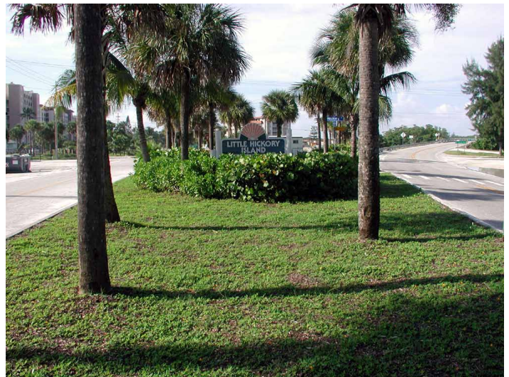
Figure 4. Perennial peanut four weeks after planting in a median near the ocean.

Perennial peanut is best suited to south Florida conditions where winter frosts are infrequent. Perennial peanut has been successful in north and central Florida conditions where annual frosts occur, damaging above-ground foliage. Peanut is adapted to the droughty, infertile sands of Florida. The peanut legume, in association with Rhizobium , fixes atmospheric N. This means that it requires no applied external nitrogen source. Phosphorus applications may be unnecessary in Florida sands rich in P. The peanut legume is highly resistant to plant and soil pests.