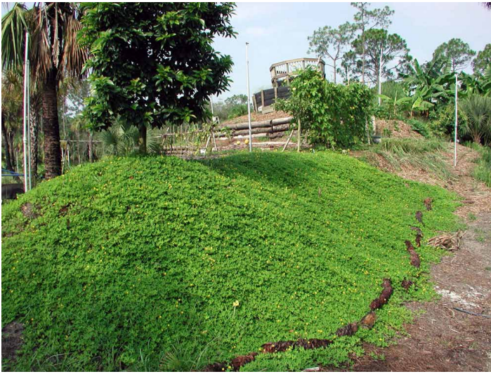
Figure 2. Perennial peanut used on a landscape berm.

landscapes (Fig. 2, Fig. 5), road medians (Fig. 3, Fig. 4), driveways and parking lot islands (Fig. 6), golf courses, along berms, septic tank mounds, and canal banks. Perennial peanut can also be used as a buffer to waterways prone to runoff high in N (Nitrogen) and P (Phosphorus).