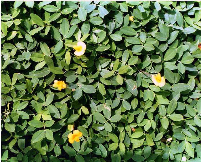
Figure 1. Perennial peanut canopy with yellow-gold flowers.

The perennial peanut evolved in tropical conditions and is adapted to subtropical and warm temperate climates. In the northern hemisphere, this would include locations below