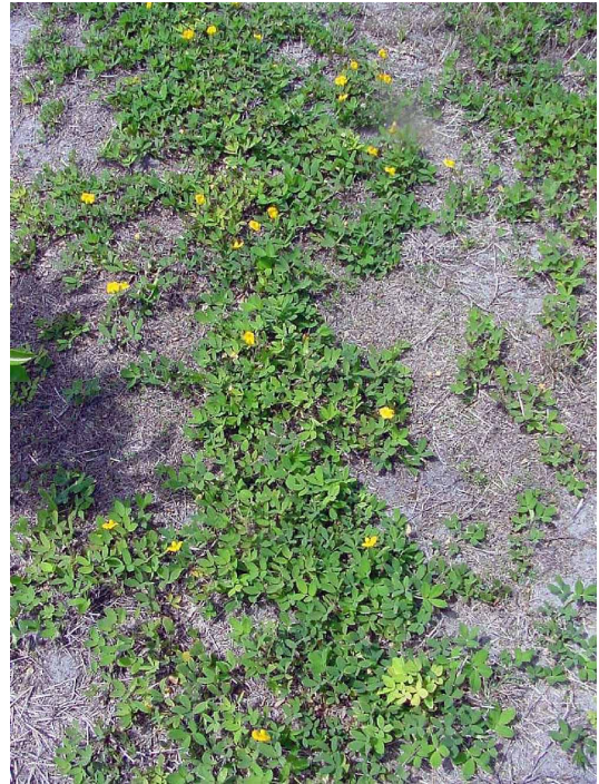
Figure 7. Perennial peanut during establishment from strip planting.

Sod plugs can be cut from the delivered sod pieces and cut into smaller squares and planted in checkerboard layout. Sod plugs should be planted on centers no more than 12 to 18 inches apart. Plants in one-gallon nursery containers can be planted the same as sod plugs.