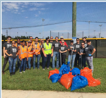
Soldiers Creek Park