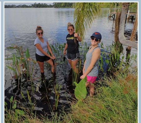
N. Horseshoe Lake