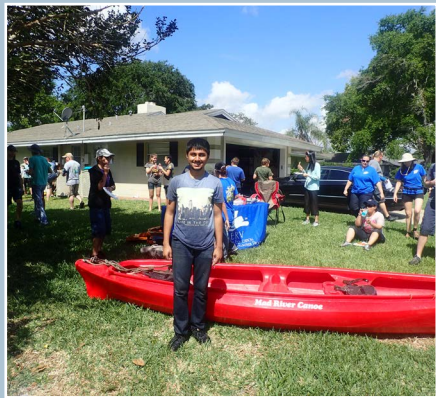
English Estates Pond