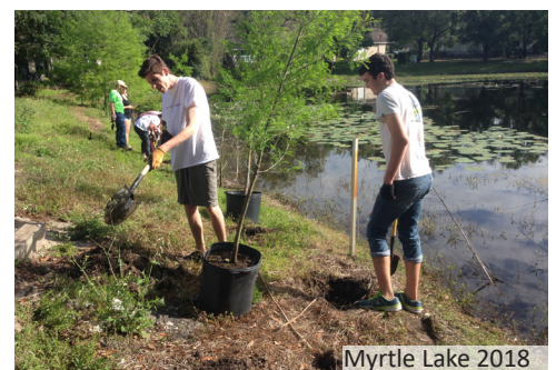
Myrtle Lake 2018