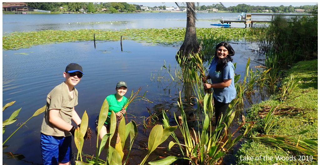
Lake of the Woods 2019

Saturday, May 15th, 2021, 9 am - 12 pm: Seminole County Watershed Management & the SERV Program invite you to help us plant shoreline vegetation to improve ecosystem function, habitat, and water quality! RSVP (required): http://bit.ly/LkOfWoods2021 or contact serv@seminolecountyfl.gov , 407-665-2457. Kick-off: 300 Carolwood Pt, Fern Park, FL 32730. Please note that this event will be capped at 20 participants, including staff, to enable social distancing for health safety. Volunteers will be required to wear masks throughout the event.