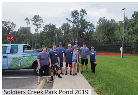
Soldiers Creek Park Pond 2019