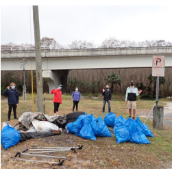
Lake Monroe Wayside