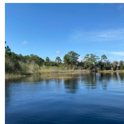
Lake Sylvan shoreline