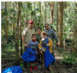
Black Bear WA