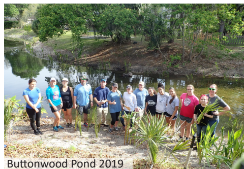
Buttonwood Pond 2019

How to Build Your Own Rainbarrel (video)