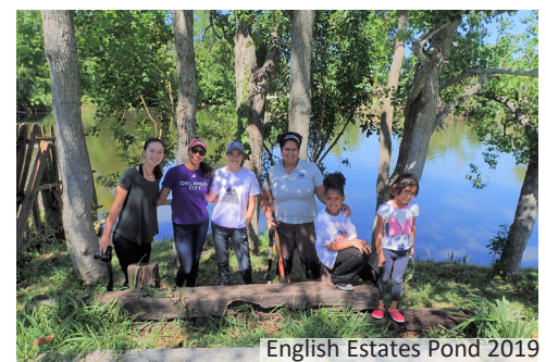
English Estates Pond 2019