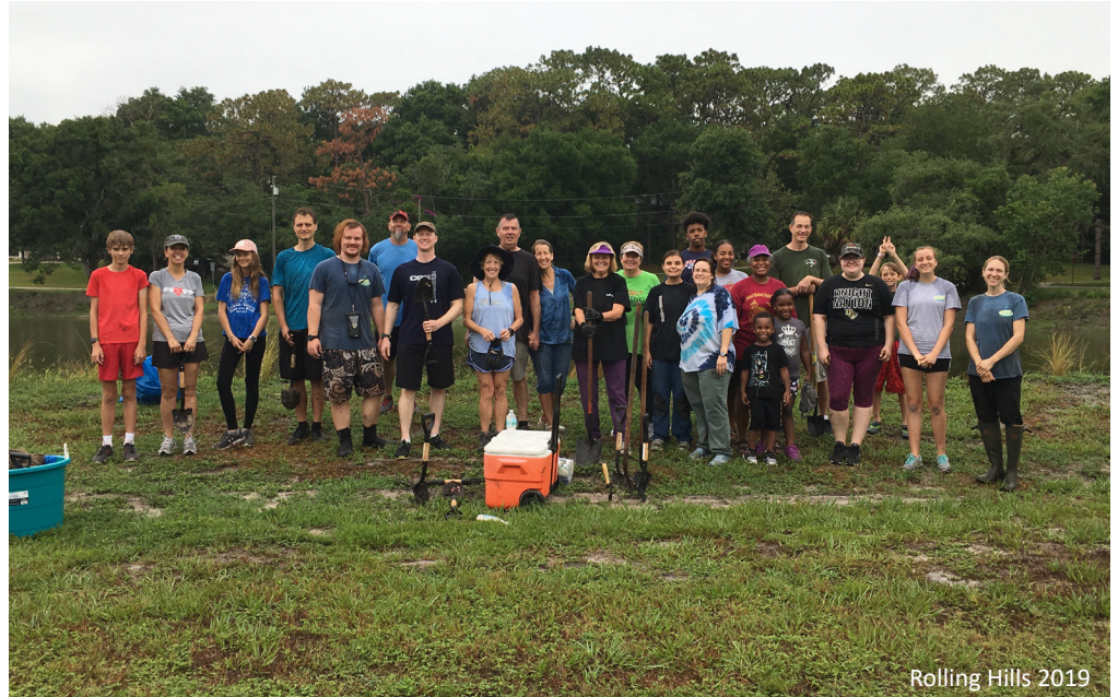
Rolling Hills 2019

After careful consideration, we have made the difficult decision to postpone our lake/pond restoration events until next spring (2021). Our volunteers' safety is our highest priority, and planning for social distancing and other health precautions during these popular multi-location events has proved to be incredibly difficult. Please check out our other options for other more independent volunteer opportunities on the following pages until we can all come together again. We have missed our wonderful volunteers!