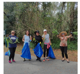
Seminole Wekiva Trl.