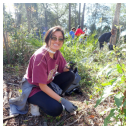
Spring Hammock Pr.