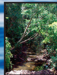
Little Wekiva River