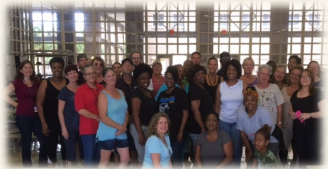
Pictured right: Seminole County Community Services Dept. Staff and other County employees at Winter

Additionally, the county opened nine shelters and housed over 1,600 people and over 200 pets. The Community Services staff along with employees from other departments manned the shelter at Winter Springs H.S. Seminole County is still in recovery mode, subsequent to the wrath of Hurricane Irma with an estimated 1,000,000 cubic yards of debris scattered countywide. Special thanks to all of the dedicated Seminole County employees.