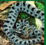
DUSKY PIGMY RATTLESNAKE