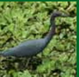
LITTLE BLUE HERON