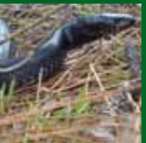
EASTERN INDIGO SNAKE