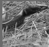
EASTERN INDIGO SNAKE