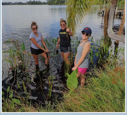
N. Horseshoe Lake