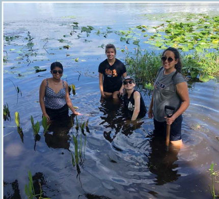
Lake of the Woods