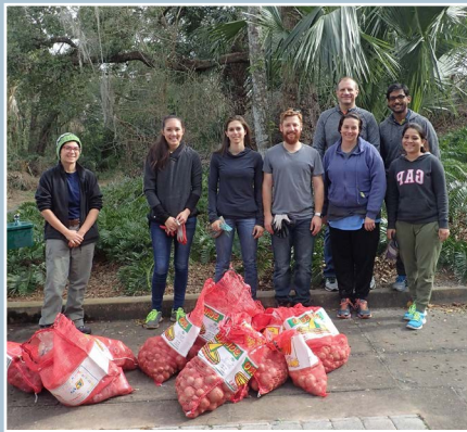
Altamonte Invasive Raid