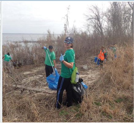
Lake Monroe Clean-Up