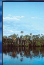
St. Johns River