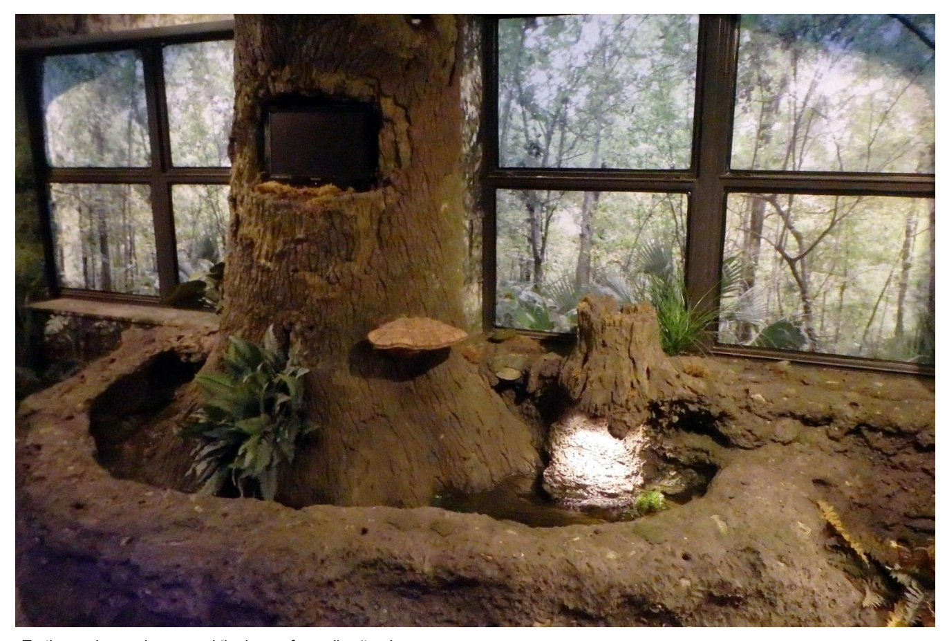
Turtle pond wrapping around the base of a replica 'tree'