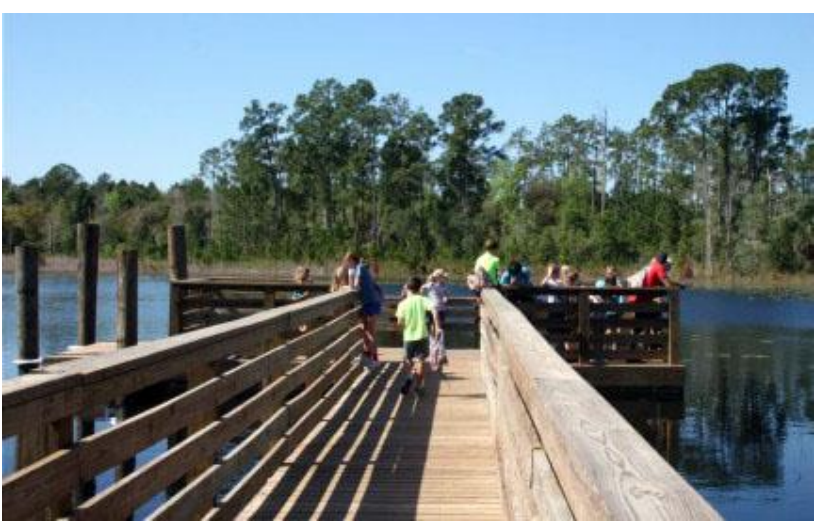
Geneva fishing pier during 2015 Spring Break Eco-Camp