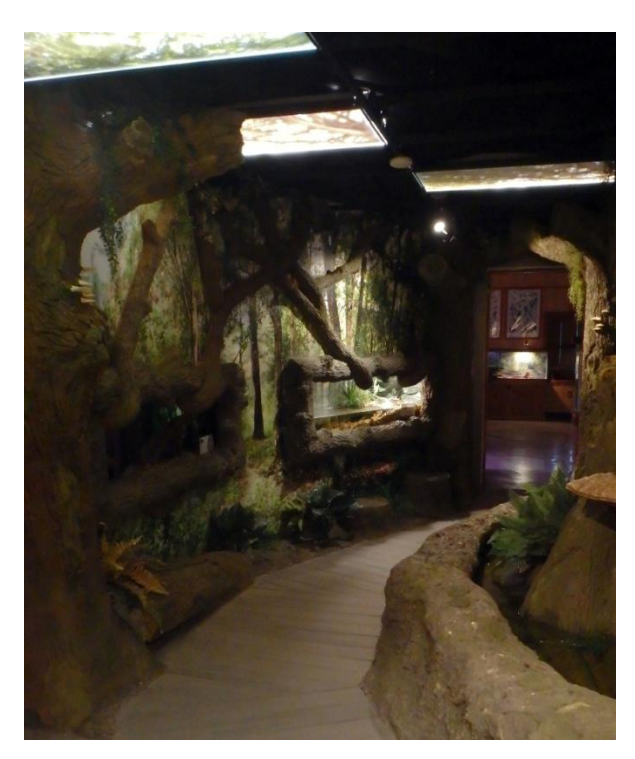
Boardwalk between the alligator tank and the turtle pond leading towards the main Nature Center room