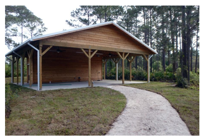
New pavilion at Ed Yarborough Nature Center