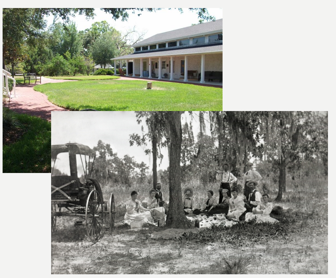
- Picnic Near Orange City, FL 1898, Courtesy Florida Memory Project