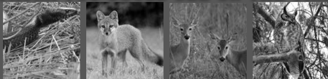
EASTERN INDIGO SNAKE GREY FOX WHITE-TAILED DEER GREAT HORNED OWL