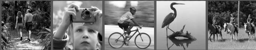
HIKING PHOTOS BIKING BIRDWATCHING EQUESTRIANS